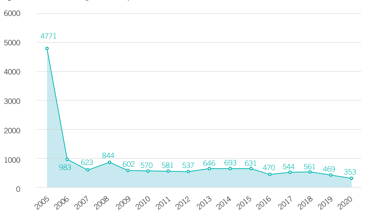
Figure 1 Number of new registrants who joined the NACPR 2005–2020*

*The implementation of a new database has allowed for more accurate reporting of figures. Some statistics published in previous years have been adjusted accordingly.