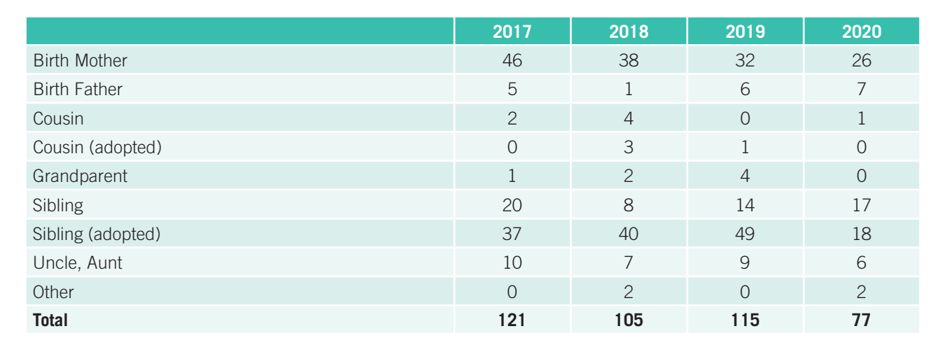
Table 3 Matches by Relationship by year 2017–2020

Traditionally, the majority of matches recorded on the NACPR relate to birth mothers and adoptees (26 in 2020). The second highest category is between siblings who were both adopted out (18 in 2020), while the third highest relates to adoptees and birth siblings (17 in 2020). For a concise breakdown of recent figures, please see Table 3: